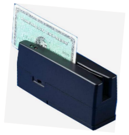
MSR500 L105 x W32 x H58 mm